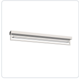
SF16240-BN Brushed Nickel